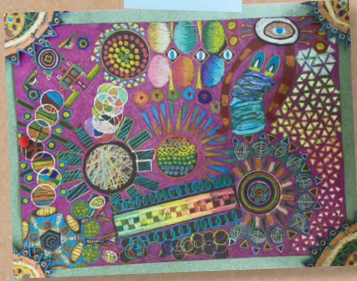
Gavin D'Apice Pine Brook Elementary

Non-profit Org. U.S. Postage PAID Rochester, NY Permit #1365