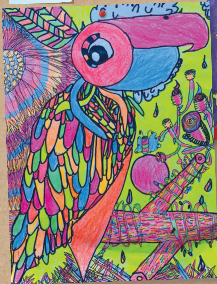
Olivia LoVetro Pine Brook Elementary