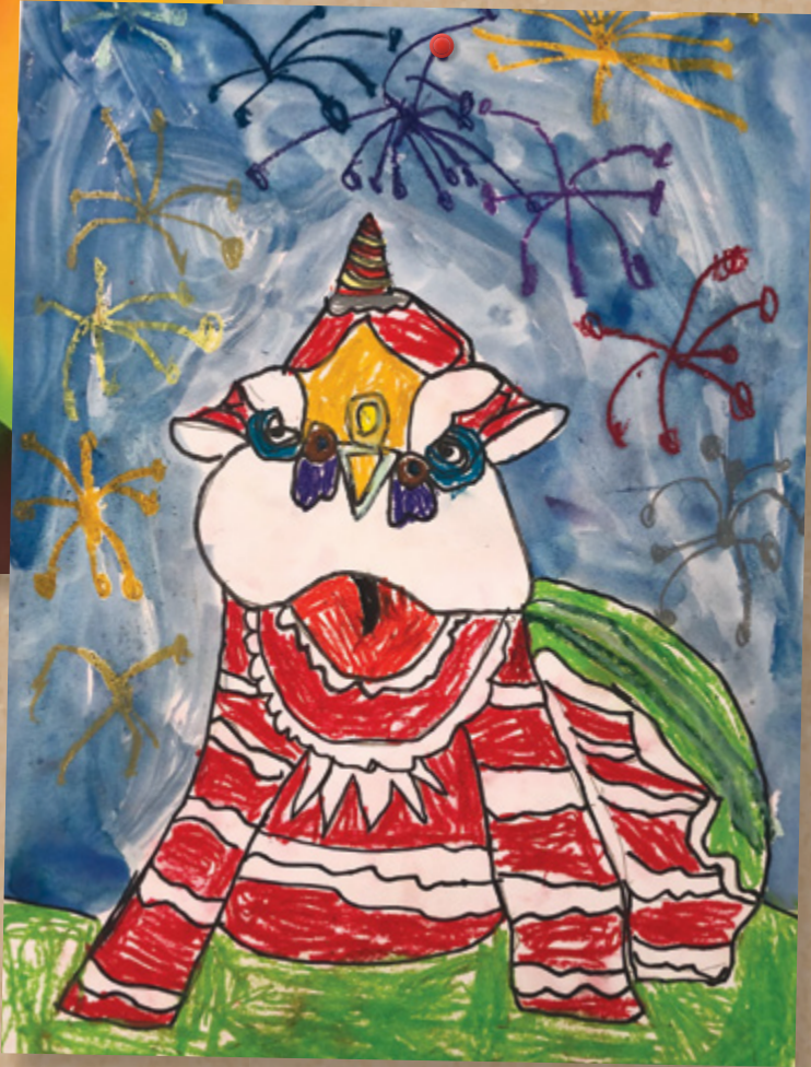
Lukas Fluet Autumn Lane Elementary