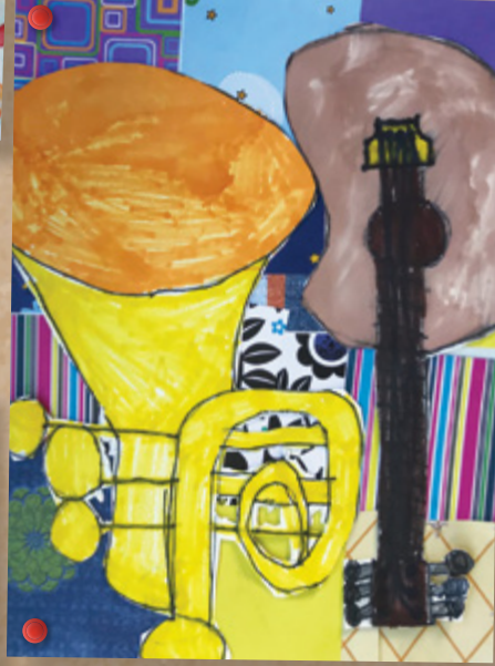
Mikael Texidor West Ridge Elementary