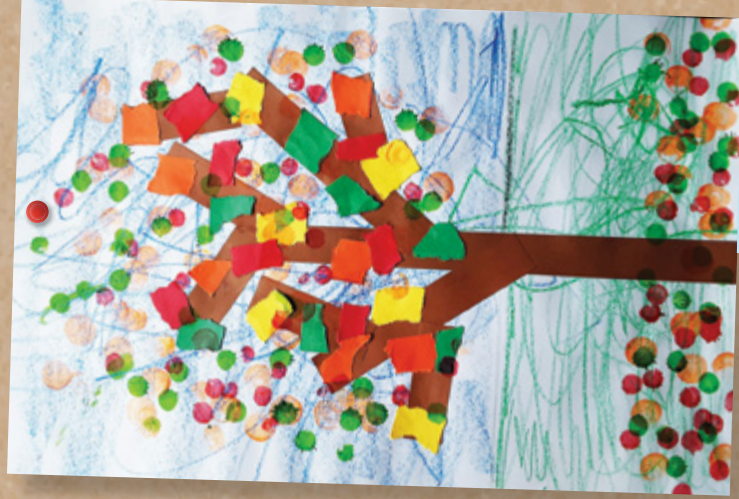
Hunter Ouellette Longridge Elementary